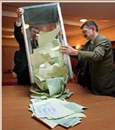
Results from Central Election Commission Ballots counted = 99.48%

A Razor Thin Lead for Orange Parties ..... 1